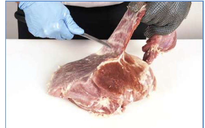
3 ... from the topside by following the natural seams as illustrated.