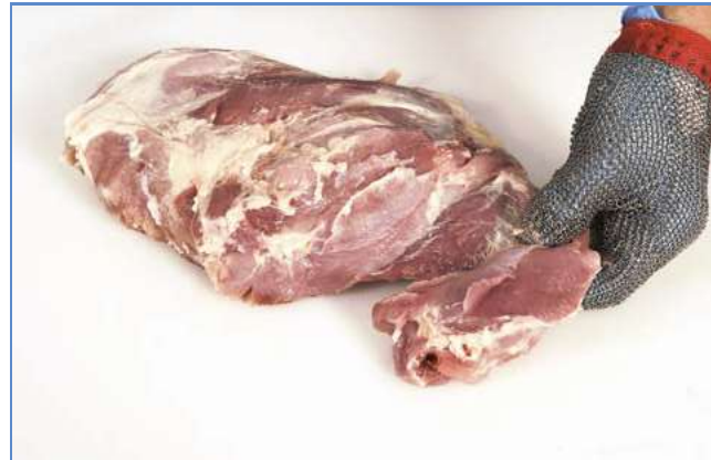
2 Remove the gracilis and associated muscles ...