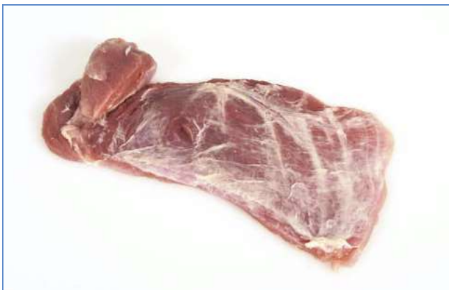
4 Gracilis and associated muscles.