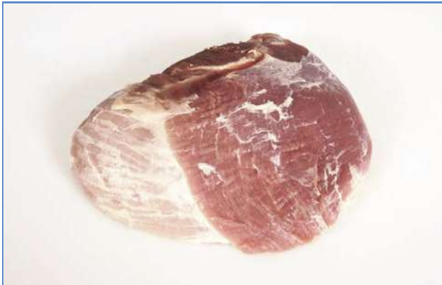
1 Topside of pork.